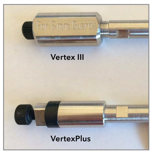
Fig.1 Hardware types